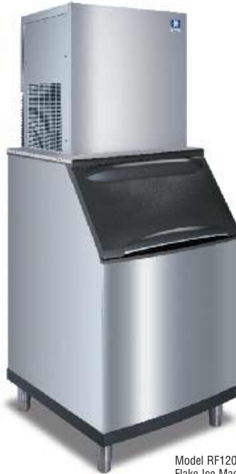
Model RF1200A Flake Ice Machine on B-570 Bin